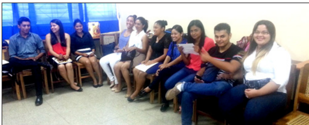
Picture No. 3. Students awaiting to perform their dramatization.