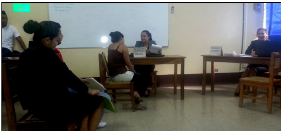
Picture No. 1. IV year students of Banking and Finance dramatizing a job interview process (emphasis in dress and attitude in the interview)