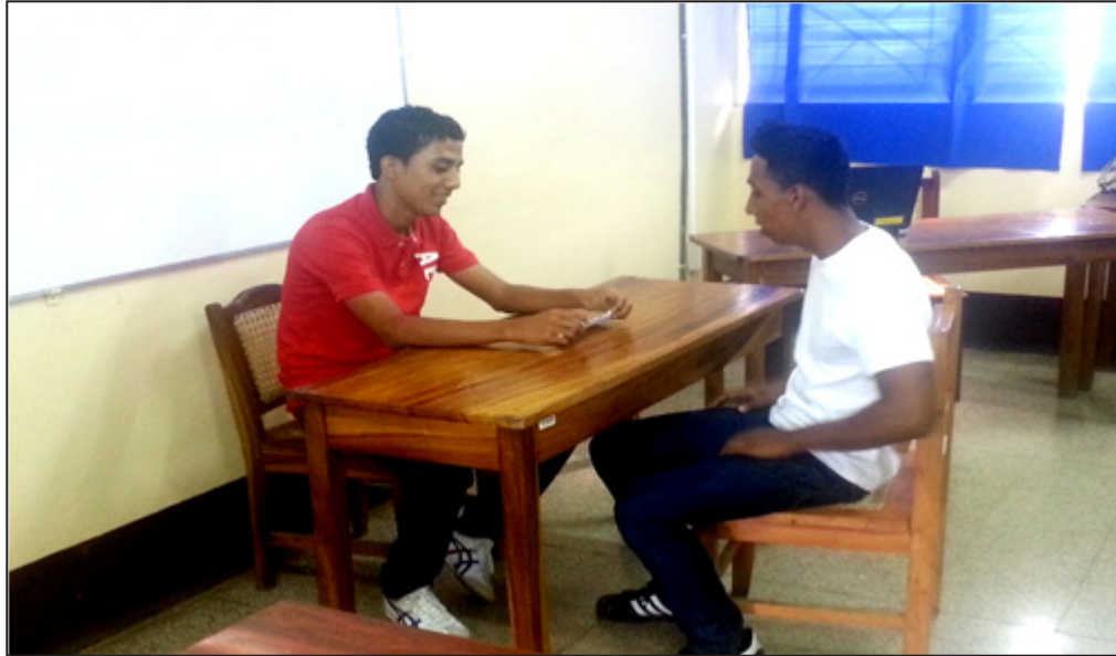
Picture No. 4. It is noted in the following picture, two students who due to their personal characteristics, appeared very timid during the development of previous classes, but it was very interesting to note that by developing its dramatization were very spontaneous, insurance and even made them easier to cooperate with his team. From this activity the security level of these two students increased. In this situation the advantages of using dramatization as cooperative learning strategy is evident.