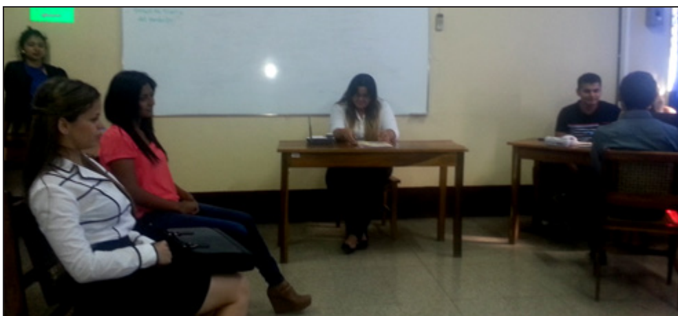
Picture No. 2. Team dramatizing a scenario in which the candidates are highly competitive in banking and finance, but it is selected the candidate who has the best presentation and not professional preparation.